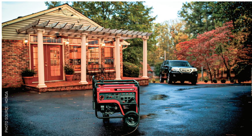
Position portable generators at least 25 feet outside the home, away from doors, windows and vents that can allow CO to enter the home

If you have questions about proper use of portable generators, we're here to help. Give us a call at 217-235-0341 or contact us at [email address/web link].